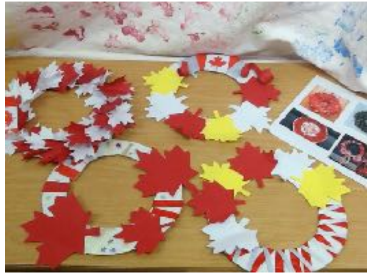
They made Canadian Wreaths!